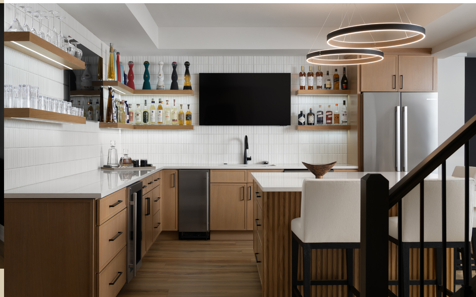
The lower level's centerpiece is a full-service entertainment bar.