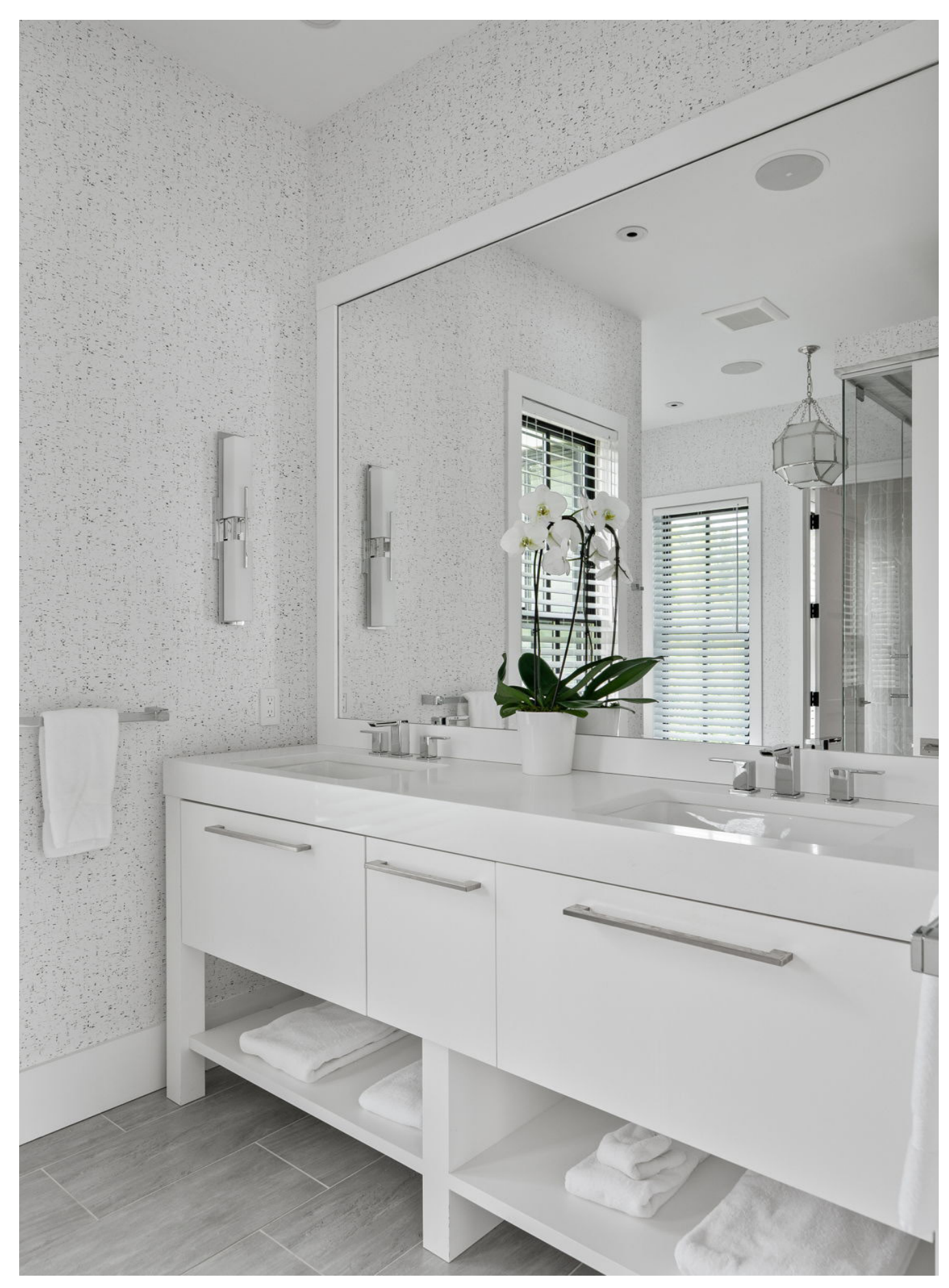
A large, framed mirror replaces a small vanity mirror and is flanked by new sconces, while speckled wallpaper adds texture to the primary bathroom.