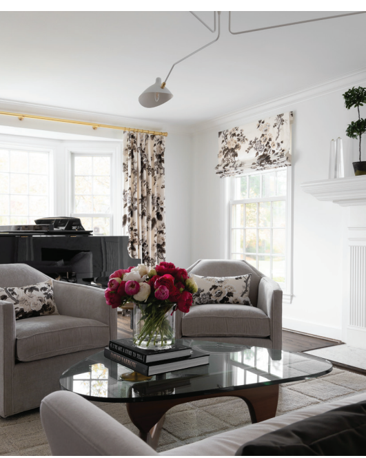
Living Room AFTER