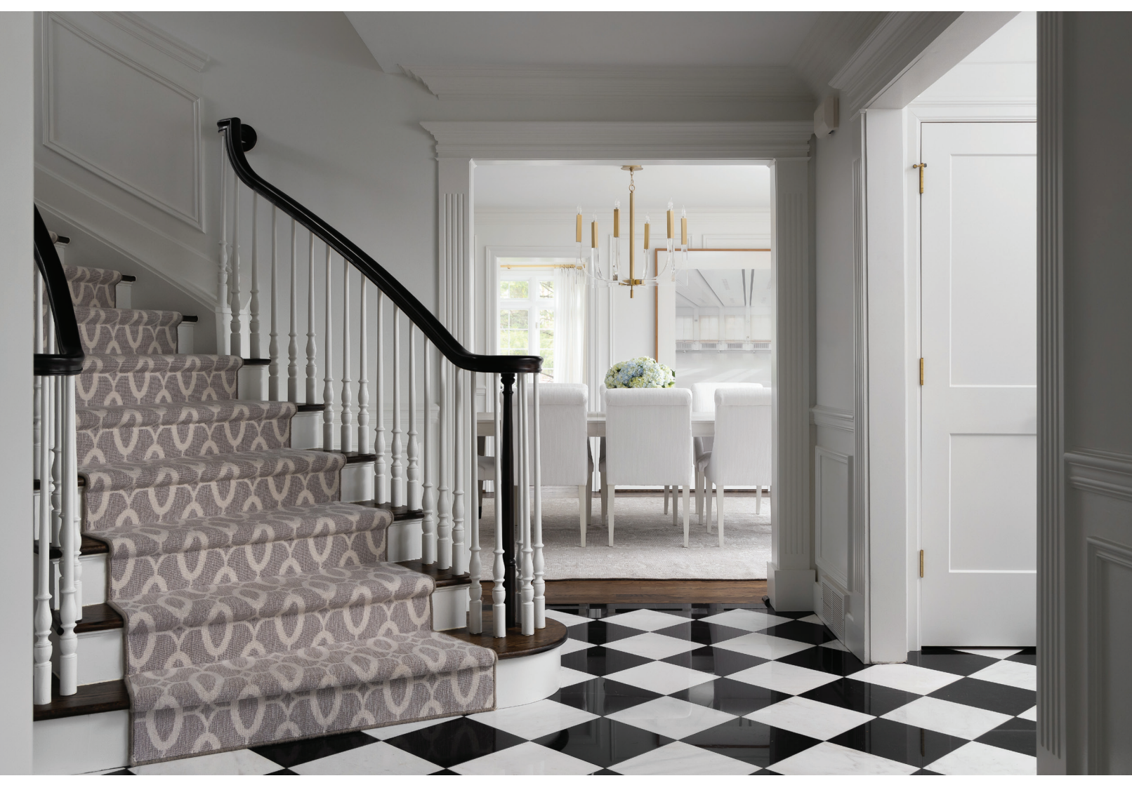
The foyer exemplifies timeless elegance with its classic millwork and checkered marble floor.