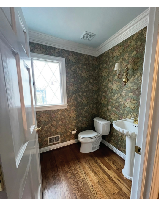
Powder Room BEFORE