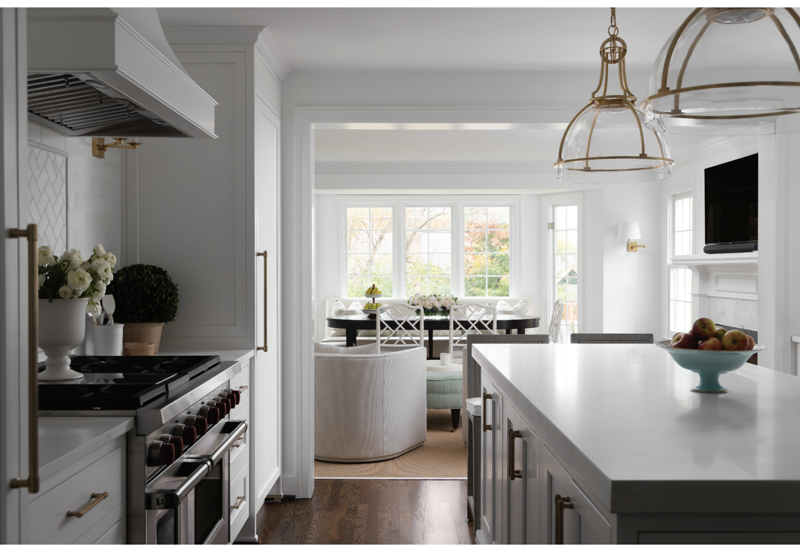
The long, narrow kitchen leads into the popular breakfast room.