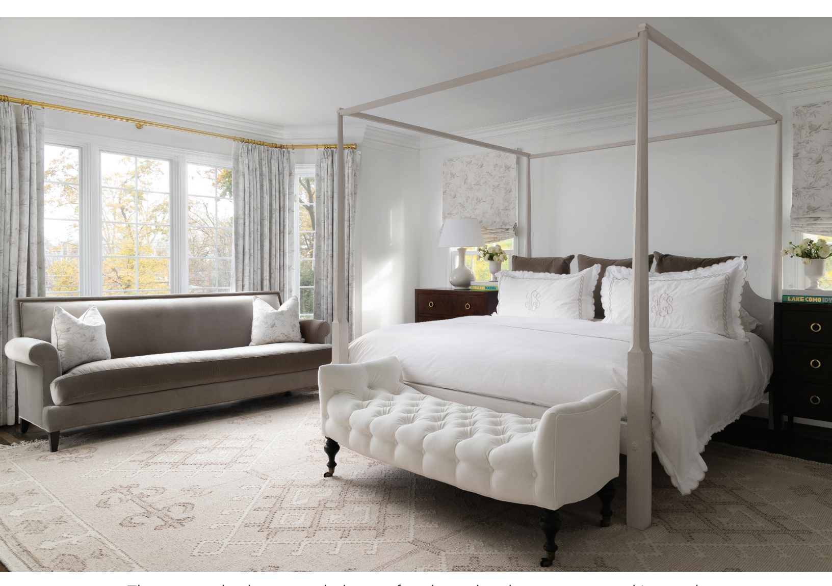
The primary bedroom is a balance of traditional and contemporary décor with a modern bed frame and classic bedside tables.