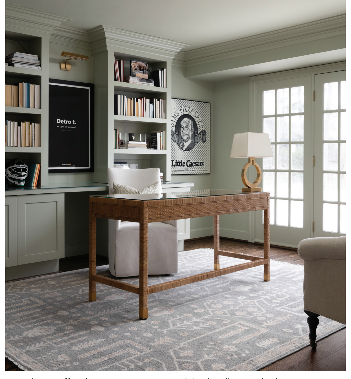
The owner's home office features sports memorabilia that illustrate his hometown connection.