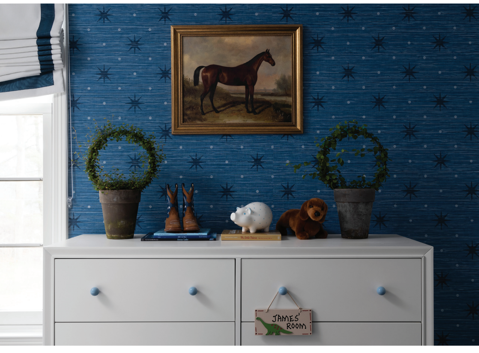
Yellen incorporated youthful elements like beloved stuffed animals and pieces that are nods to family history.