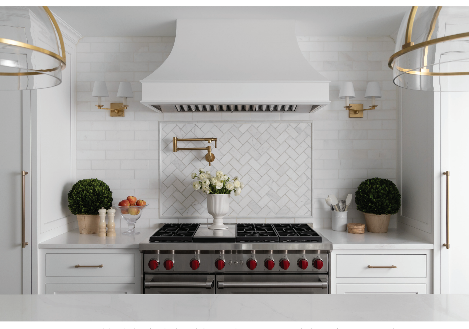
A marble tile backsplash with bone inlay is positioned above the range, and quartz countertops were added for their high-performance quality.