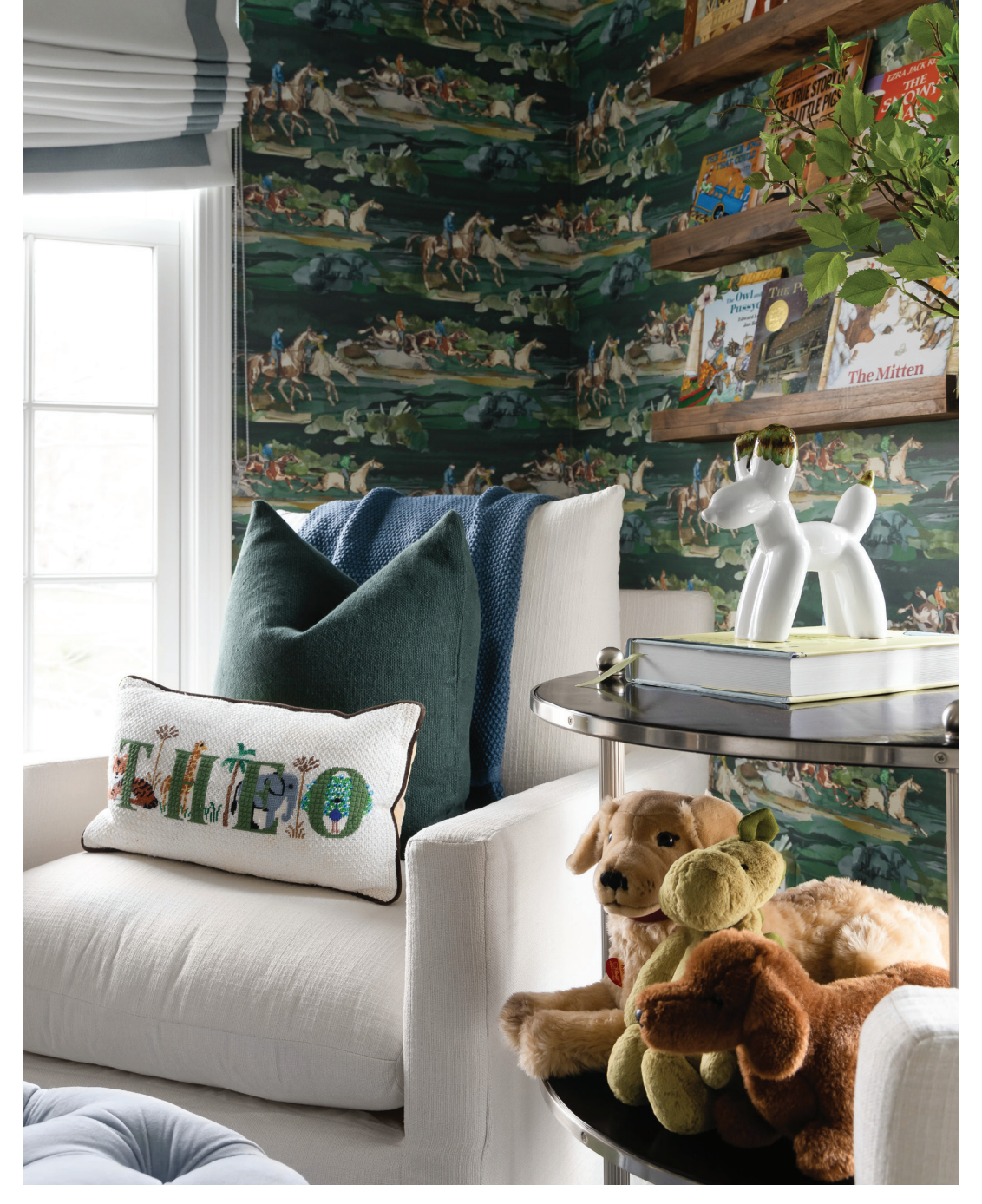
The youngest child's room is filled with his favorite toys and just a fraction of his book collection.