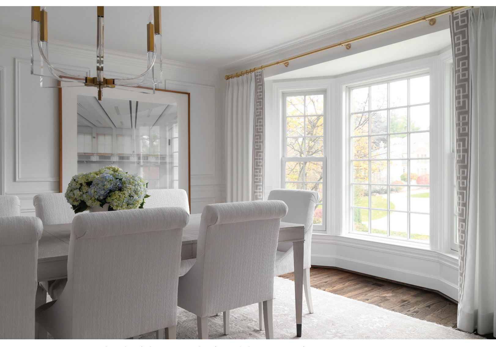
A white backdrop gives this formal dining room free reign to accessorize according to any occasion or whim.