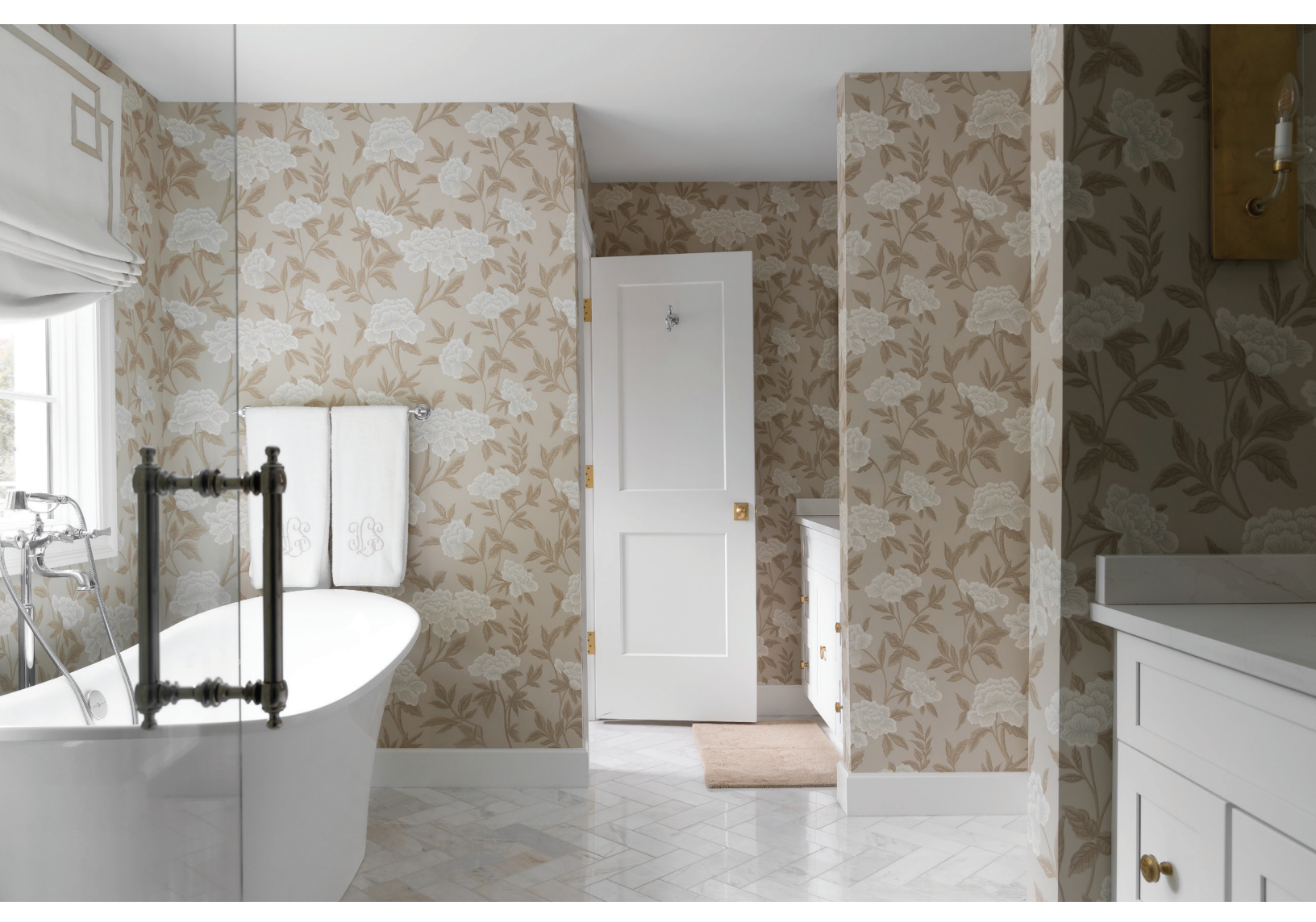
After a full renovation, the primary bathroom includes a bevy of modern conveniences and is a natural complement to the bedroom.