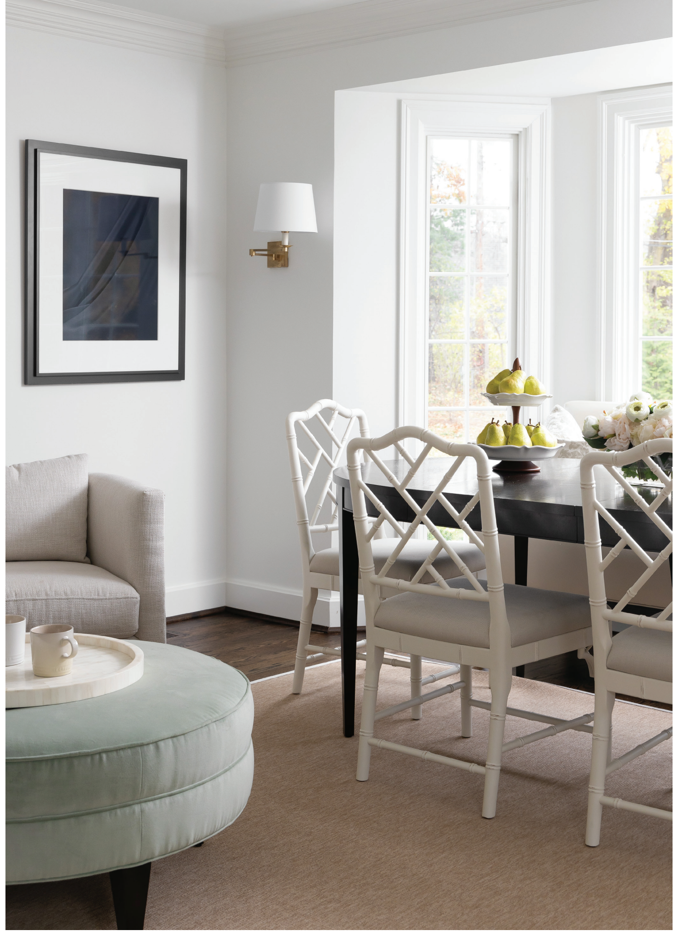
The breakfast room is an ideal space for the family to gather, eat, or simply watch television.

AVAILABLE AT MDC: City Lights Detroit sconces; Flooring Design rug; CAI Designs dining table and chairs, lounge chairs, ottoman, and banquette; Designer Furniture Services + Fabrics ottoman and pillow fabric; Pindler chair and banquette fabrics.