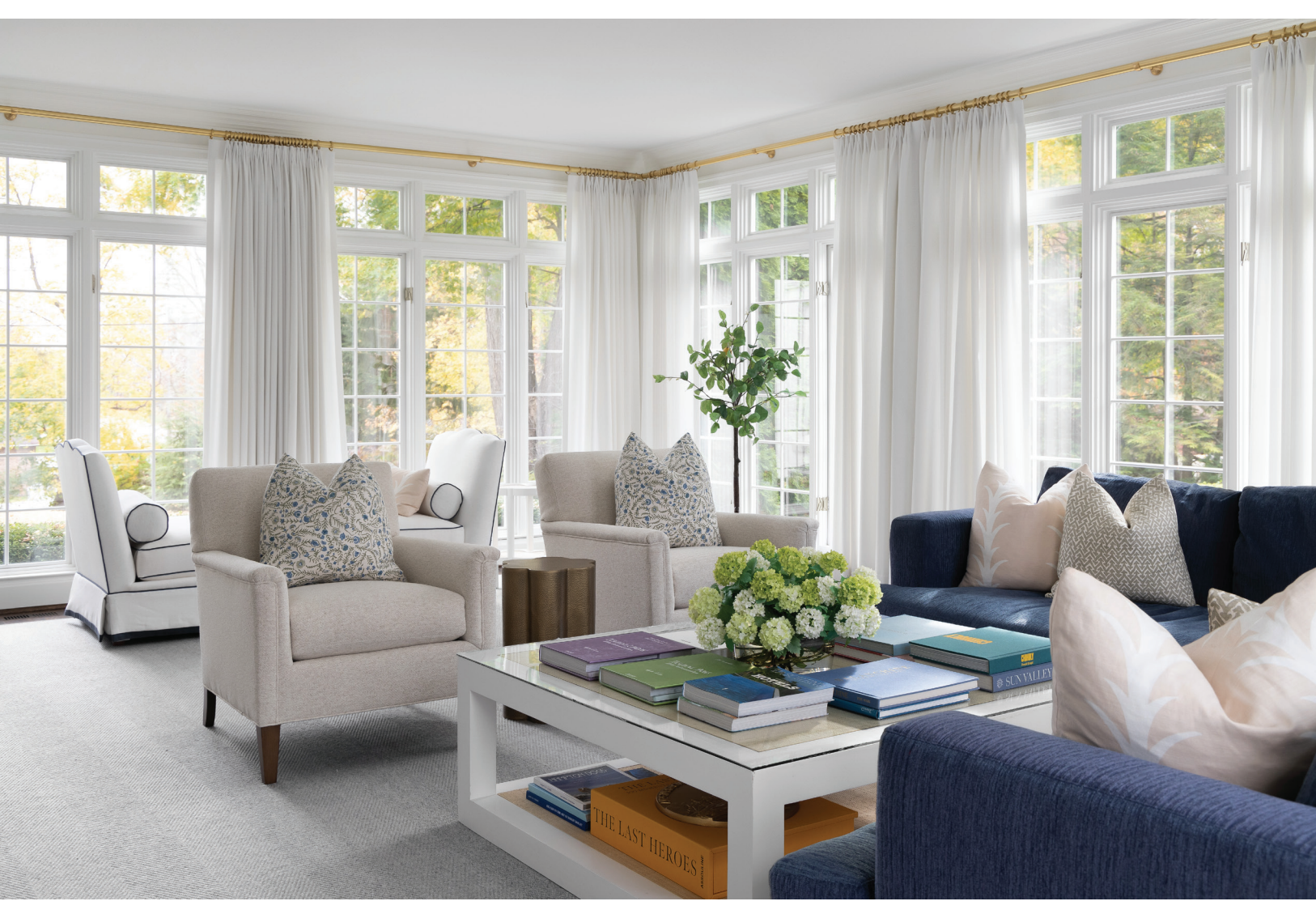
The Sunroom is bright, airy, and thoughtfully appointed for a young family.