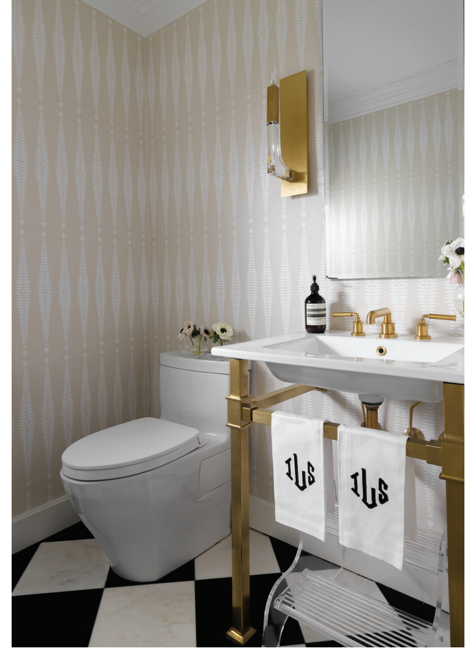
The powder room mirrors design elements found throughout the home.