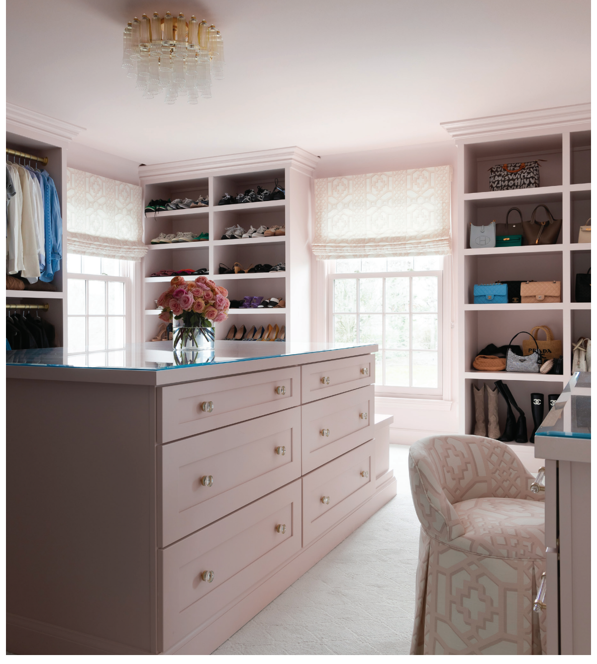
The primary closet offers ample storage and space to display the homeowner's handbag and shoe collections.