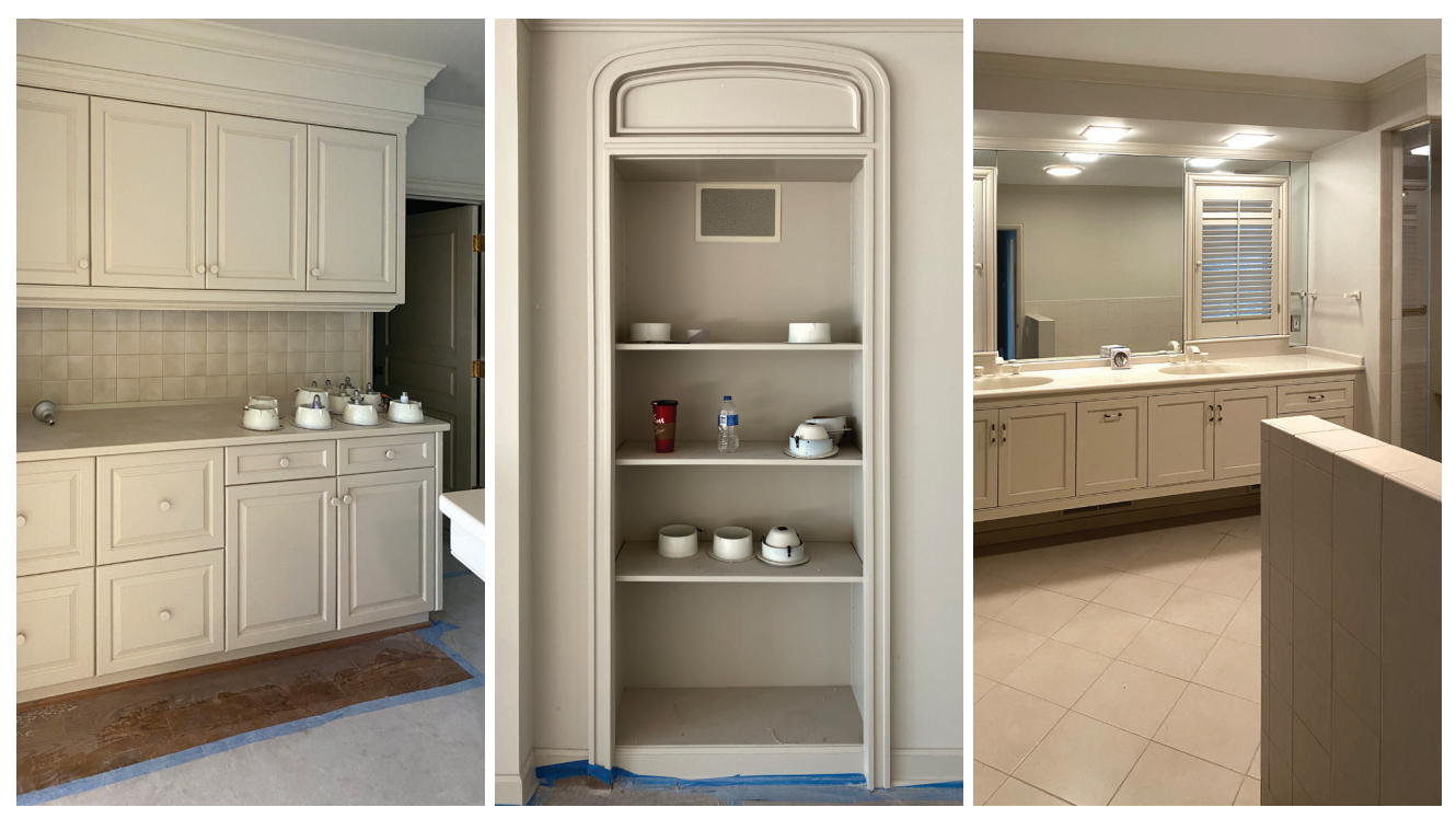
BEFORE: The home formerly had a blank, beige palette.