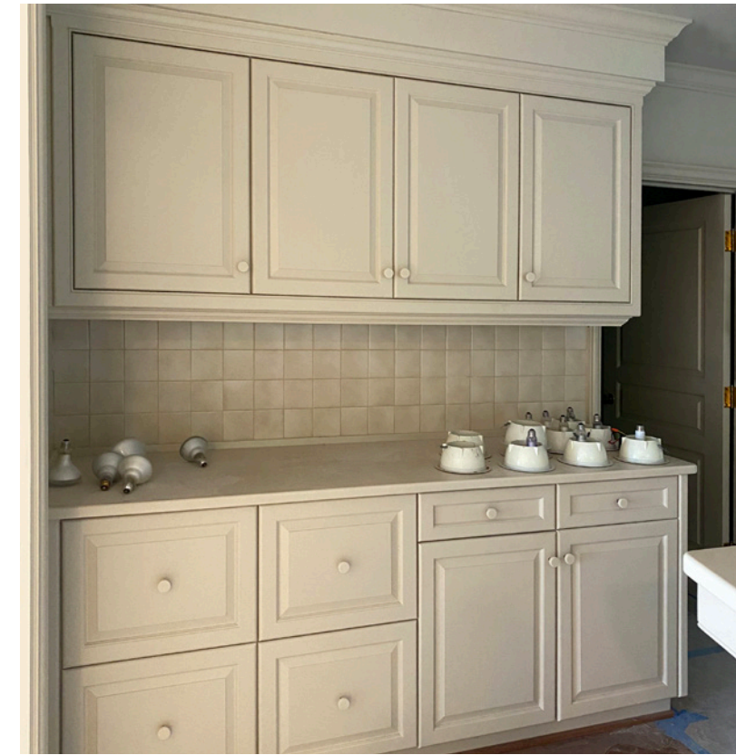
BEFORE: The home formerly had a blank, beige palette.