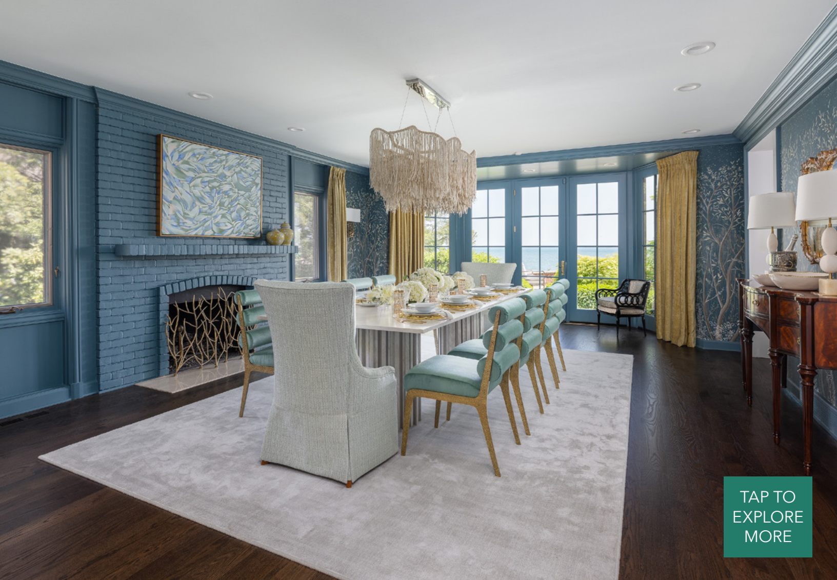
Expressive botanical wallpaper, watery hues, and bold splashes of chartreuse offer a chic dining experience for guests.