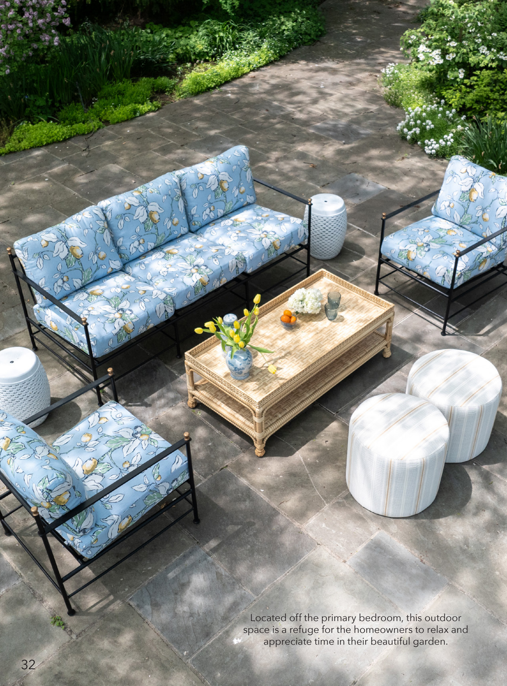
Located off the primary bedroom, this outdoor space is a refuge for the homeowners to relax and appreciate time in their beautiful garden.