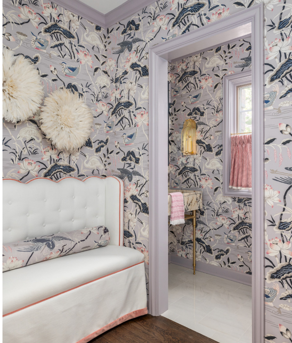
Designed to impress guests, this powder room has a delightfully feminine appeal. Feathered Juju hats above the wall bench are a nod to the owner's heritage.