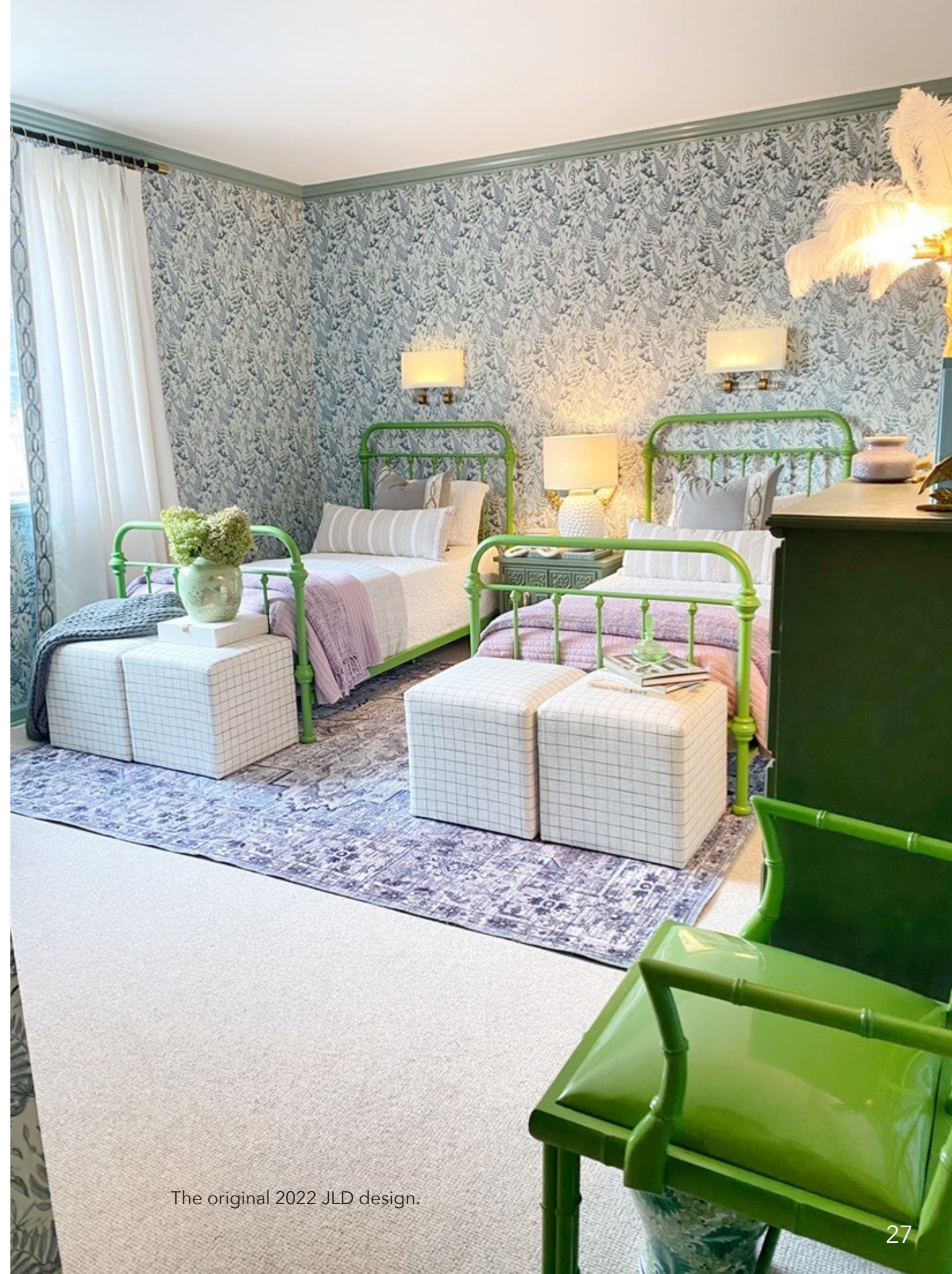
The original 2022 JLD design.

AVAILABLE AT MDC: Schumacher bed frame fabric; Kravet/Lee Jofa/Brunschwig & Fils wallpaper; Rozmallin drapery fabric; CAI Design lighting.