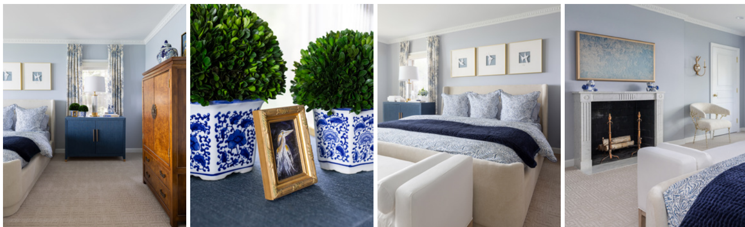
Equal parts feminine and masculine, the primary bedroom suits both homeowners.