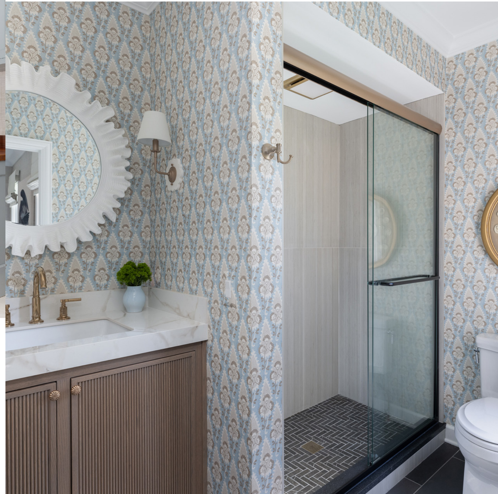
Directly off the laundry room is a full-size bathroom showcasing floral wallcovering inspired by a Georgian era French block print, reeded-detail cabinetry, and the same large-format black tile as the laundry room.

AVAILABLE AT MDC: Rozmallin wallpaper and custom bench fabric; Cercan Tile floor tile.