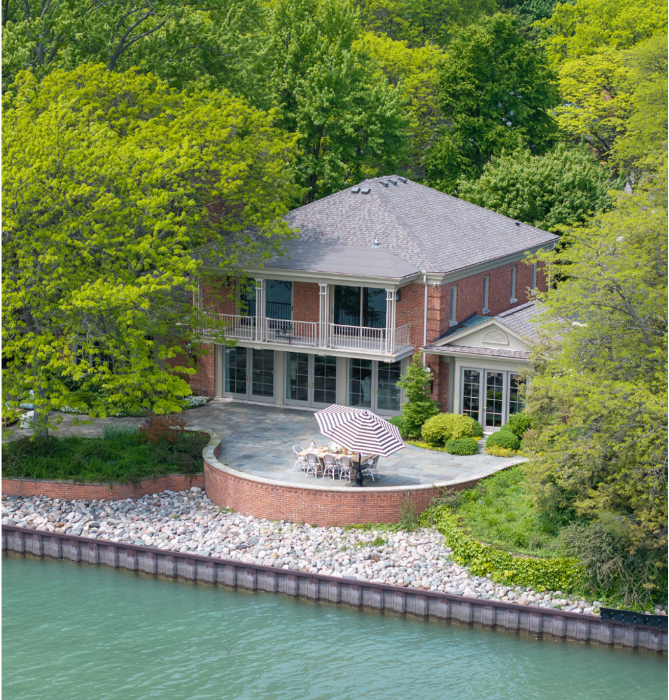
An exterior view of the home on Lake Saint Clair.