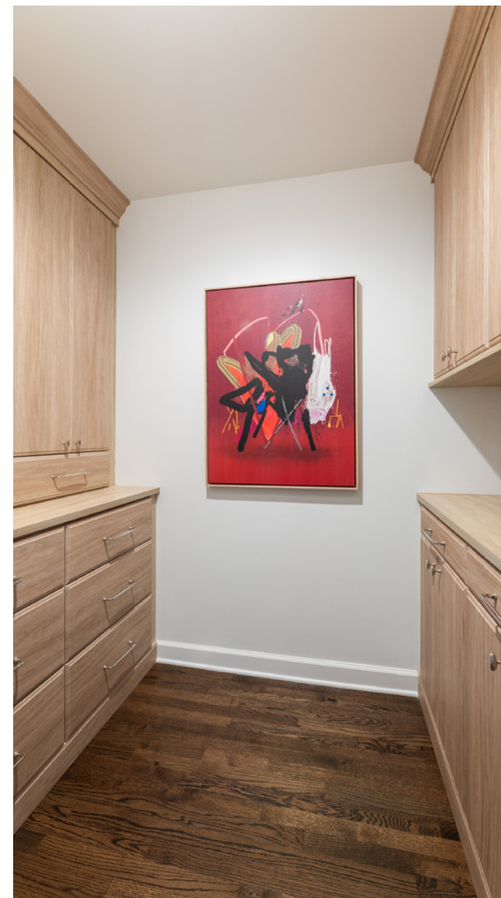
Located off the kitchen, there is plenty of room for dry goods, serveware, and cookware.

A 60-inch range with two ovens was installed, and to compensate for the removal of the upper cabinets, Loperfido flanked the range with extra-large 36-inch drawers for storage that organize everything from pots and pans to dishware. The designer developed corner shelves that display decorative accents and dishes in what was once a dead corner.