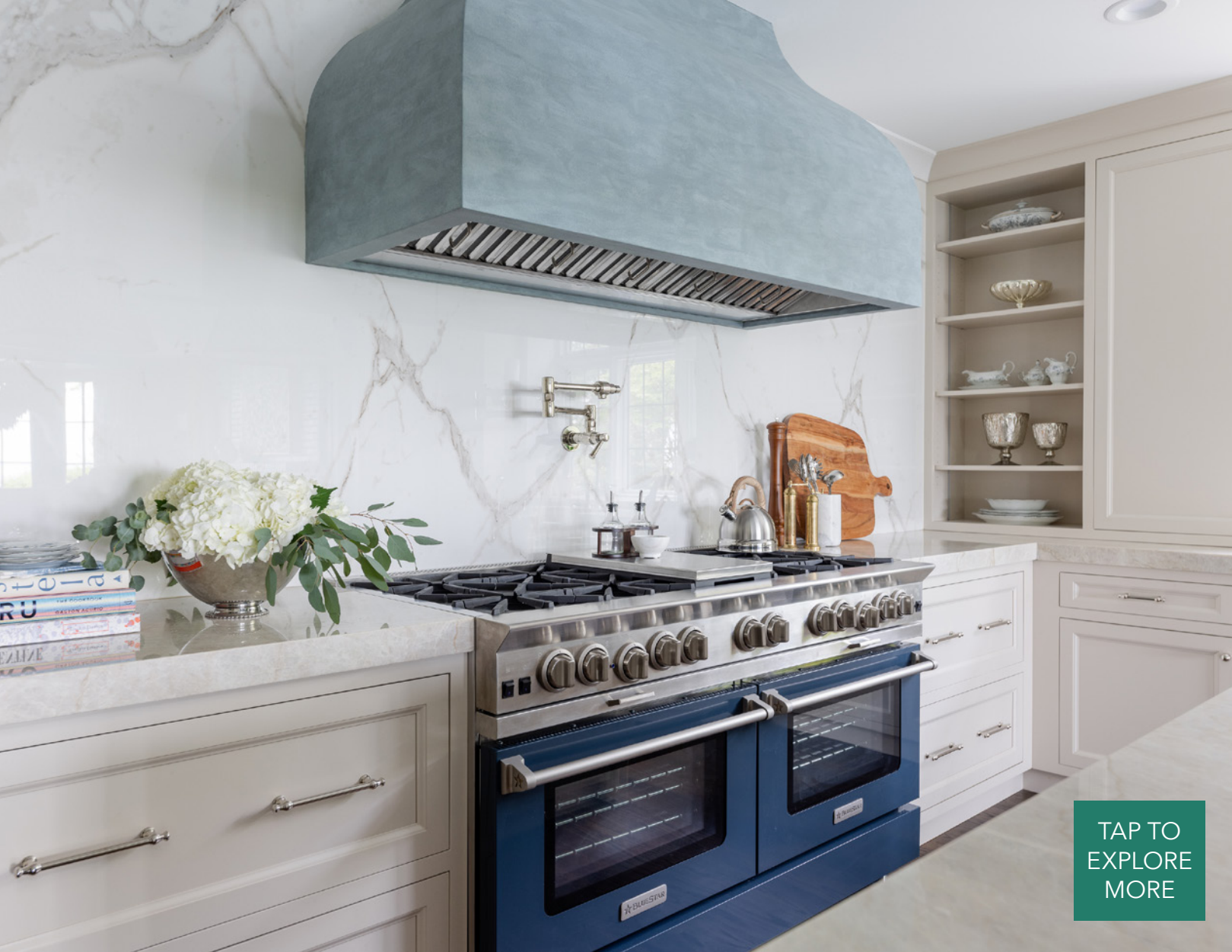
The chic, commercial-style kitchen offers plenty of storage.