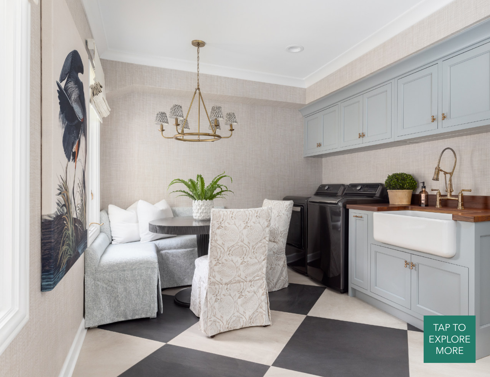
A spacious laundry area with room to take a break between wash cycles.