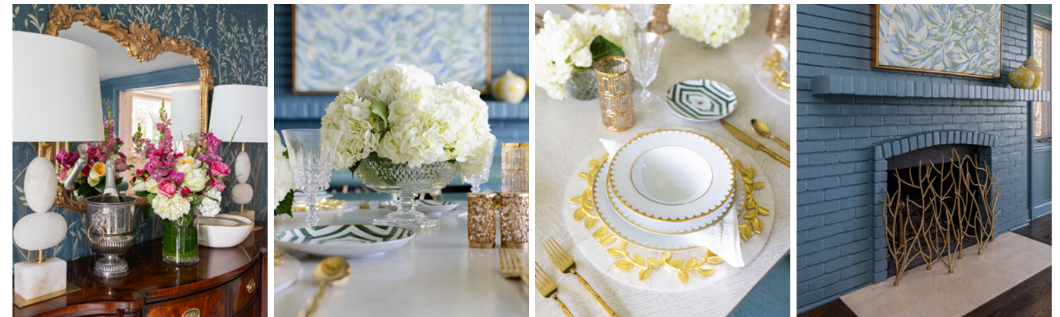
Nestled between the kitchen and dining room is a series of pocket doors original to the space and ideal for creating privacy during meal preparation.