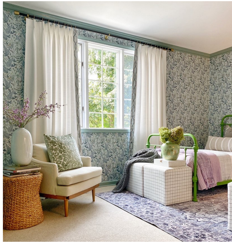
2022 Junior League of Detroit Designers' Show House