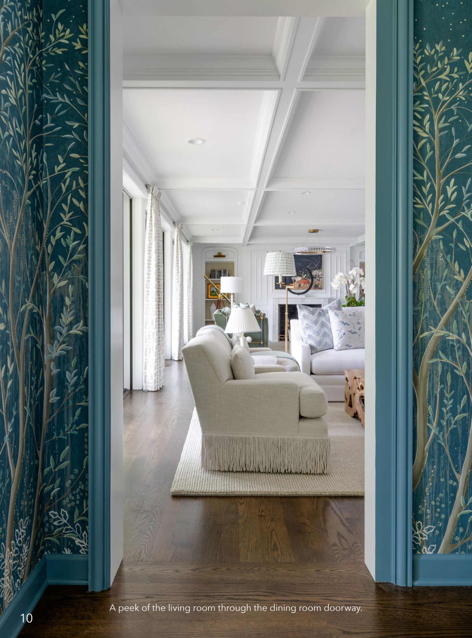
A peek of the living room through the dining room doorway.