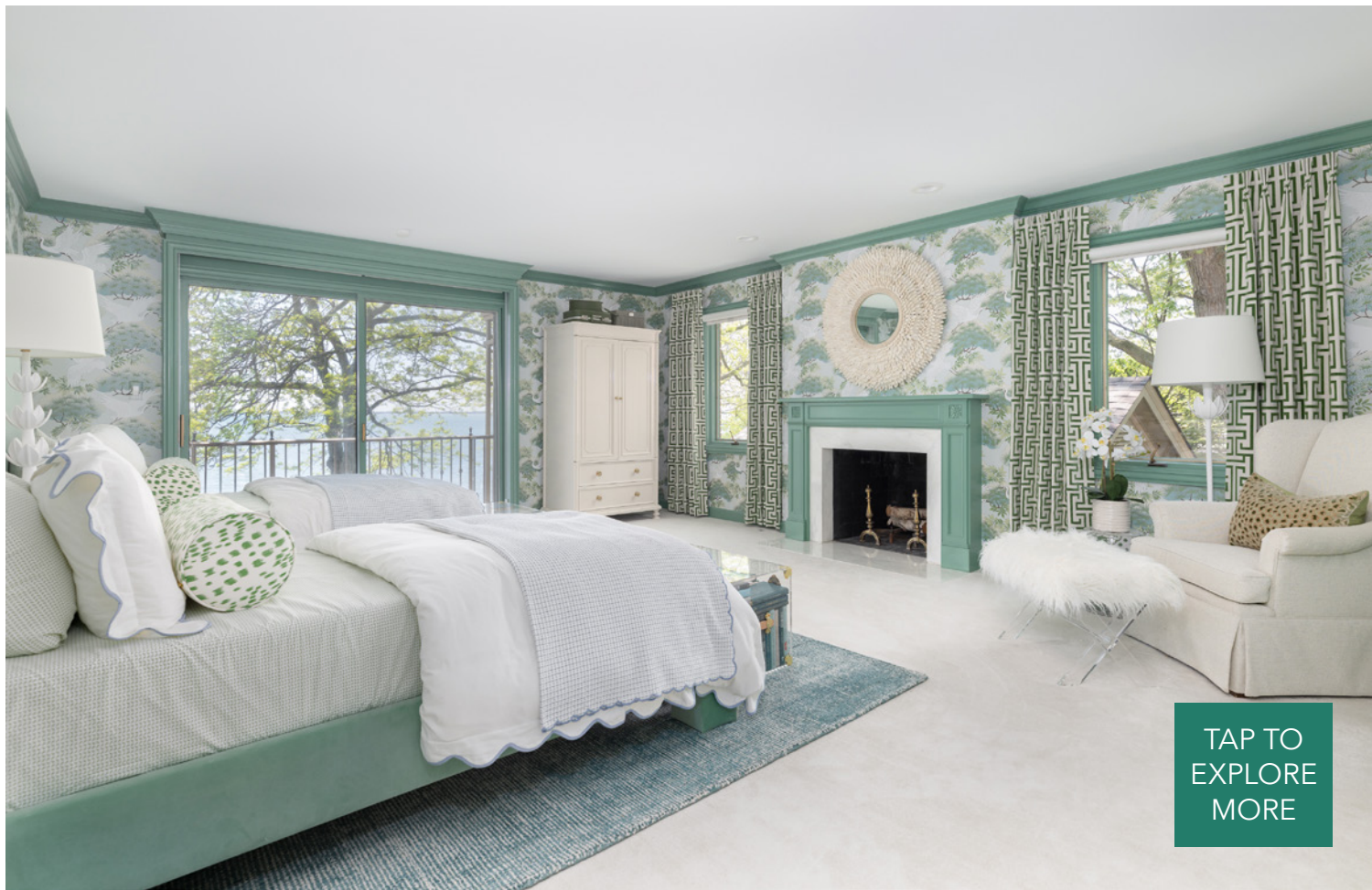
The gorgeous Alger guest room in the spirit of the original Show House room.