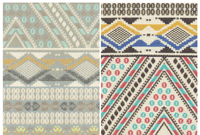
Pollack Amaya Mother of Pearl and Amaya Surf indoor/outdoor Sunbrella high-performance fabric has a stain-resistant finish and may be cleaned with bleach. Tennant & Associates