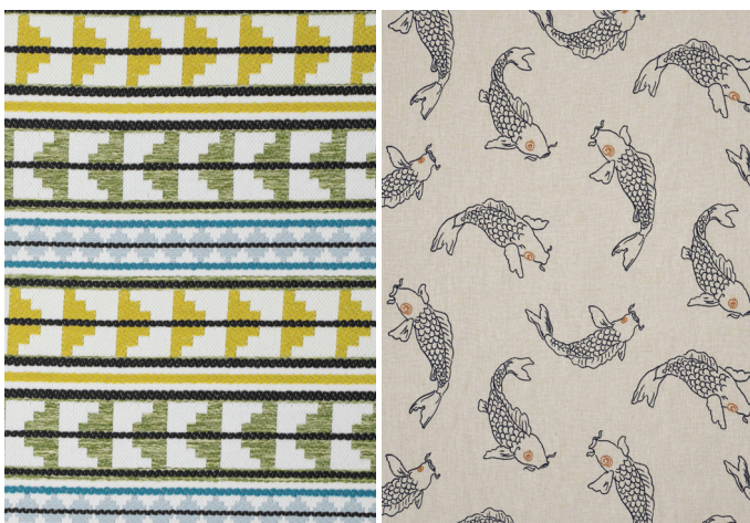
Jim Thompson Cancun in Lime and El Bagre in Sand are inspired by the colors, nature, and crafts of Mexico.