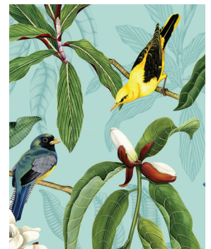
Osborne & Little Empyrea Michelia outdoor fabric is offered in three colorways, and illustrates exotic birds perched on magnolia tree branches with white blossoms. Rozmallin