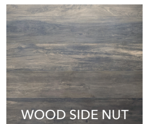
Kronos Ceramiche Ske 2.0 Outdoor Wood Side Oak pictured here in a large-format gres porcelain tile, has an authentic wood finish that's a dead ringer for the real thing. Also available in Wood Side Nut. Cercan Tile