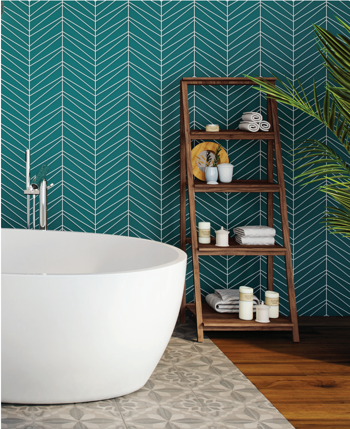
Island Stone Palms glass mosaic tile combines a fluid design with geometric elements that are reminiscent of the organic shape of delicate palm fronds. Beaver Tile & Stone

Our showrooms provide an incredible selection of beautiful patterns. Each of these examples are suitable for interior or exterior applications, and are accessible in a potpourri of colors.