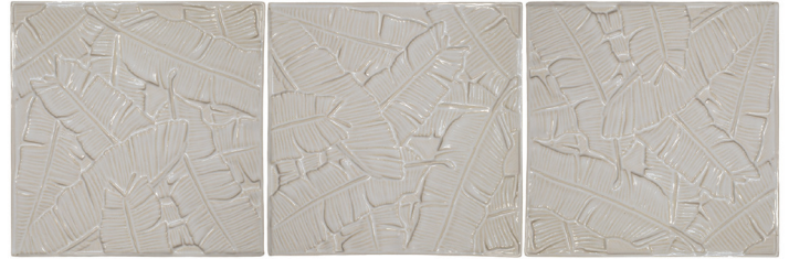
Flash Banana Leaf in Cotton Gloss indoor/outdoor ceramic tile is an excellent choice when you want to draw upon the inspiration of the tropics without the color commitment. Ann Sacks