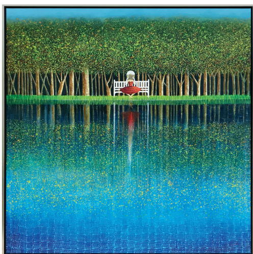
Lakeside One is an original art on canvas piece by Lena Selleck featuring a natural, calming scene with an abundance of blue and green tones. Designer Group Collection , Suite 34.